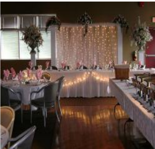
Transformation of upstairs lounge— decorated for a wedding.

Are you or someone you know planning to host a wedding, anniversary, meeting or other celebration?